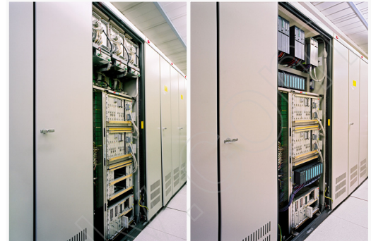
Original CJR01 Cabinet with SIMADYN and ISKAMATIK

SPPA-R3000 Turbine Controls offers smooth migration concepts for Siemens Units as well as for Third party Turbines. It provides one common HW platform for all major control tasks like Turbine Governor, Turbine Protection and Turbine Auxiliaries. Based on standard SIMATIC S7 technology it can be fully integrated in a SPPA-T2000 or SPPA-T3000 DCS environment for Human Machine Interface and engineering. With its modular structure it allows governor replacement only with implementation of the SPPA-R3000 in the remaining environment up to a Turn Key replacement of the entire installed Turbine Control equipment.